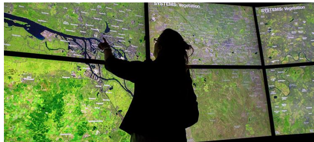
Figure 1: ESRI's "Urban Observatory" installation for community engagement.

My motivation for working on HuddleLamp was that interactive tables or large displays can be a powerful tool for collaborative exploration and sensemaking of data [1] and that they could also be used for data of local communities, for example during meetings of different stakeholders or for exhibitions or interventions in public or semi-public spaces ( Figure 1 ). Ideally such technologies turn exploring and working with annotated maps, crowd-sourced sensor data, demographics, or other community data into a social and sometimes even fun experience.